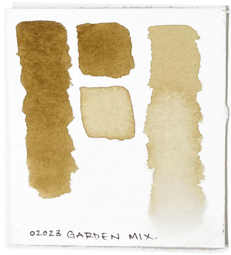
02023 GARDEN MIX.

all of these are made with: - 1000 g water - 10 g dyestuff - 12 g alum sulphate } 2:1 - 6 g calcium carbonate }